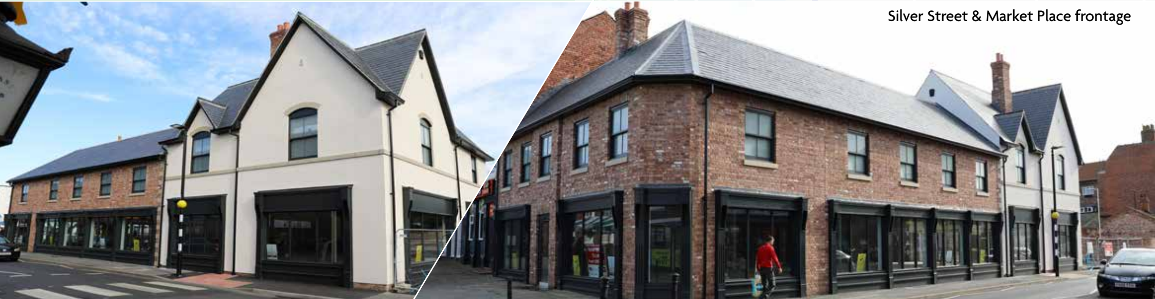
Silver Street & Market Place frontage

Misrepresentation Act: These particulars are produced in good faith and believed to be correct. Neither FitzGerald Property Consultants, Barnsdales or their client guarantees their accuracy and they are not intended to form any part of a contract. No person in the employment of FitzGerald Property Consultants or Barnsdales has authority to give any representation or warranty in respect of this property. These particulars were produced in August 2021.